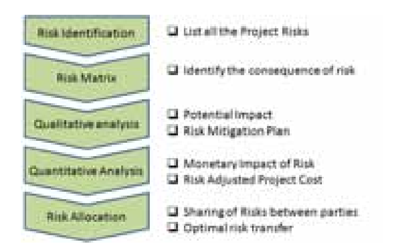
Figure 1 : Risk Management

Assessing and allocating risk to achieve added efficiency is what makes PPP a potentially powerful way of reducing project-related costs and achieving improved value for money for the public sector. The level of risk can be changed by allocating responsibility for individual risks to those who are best able to manage them. This is one of the most important component of defining an PPP project. The diagram below illustrates how Risk planning should be engaged into.