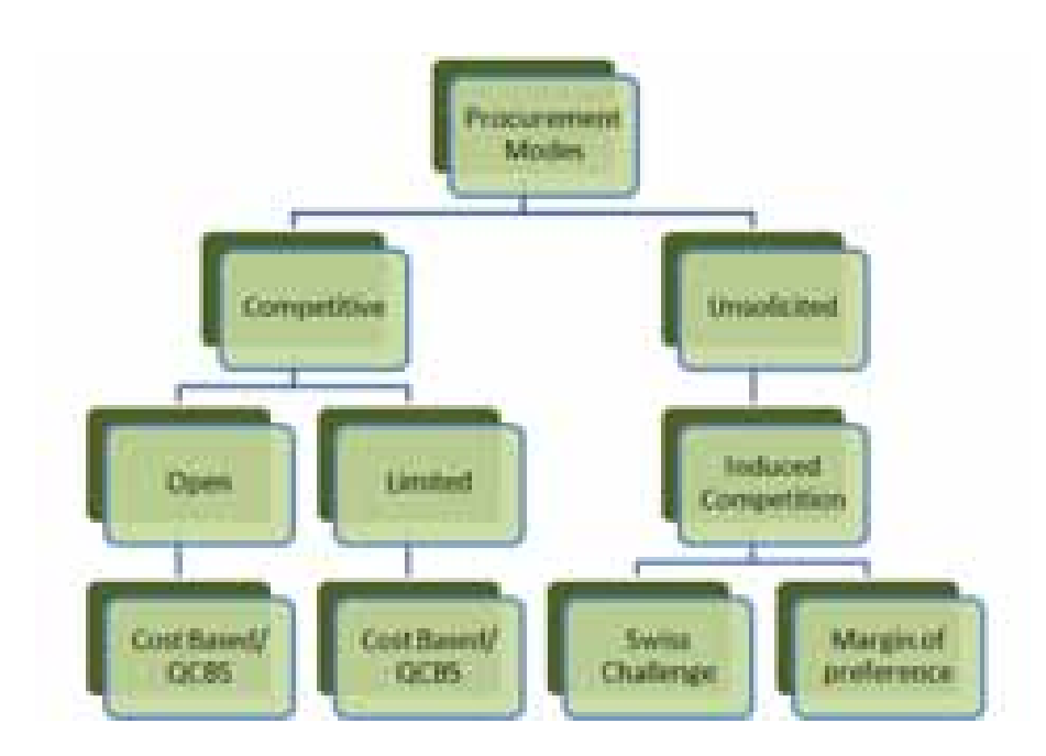
Figure 2: Procurement Options

The diagram below presents the range of methods that may be used to procure a project as a PPP. The following section describes each generic procurement strategy and its suitability to specific PPP contract arrangement.